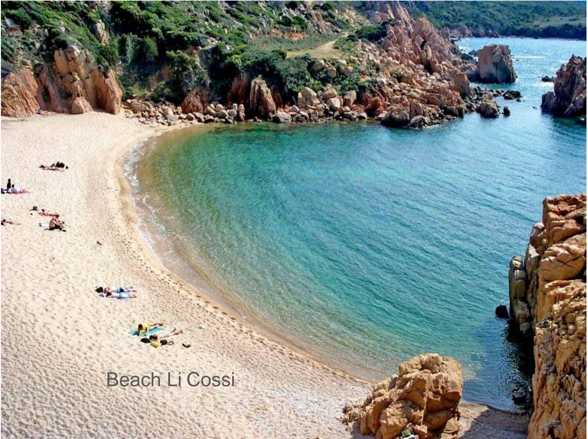
Beach Li Cossi